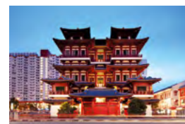
Buddha Tooth Relic Temple - Singapore