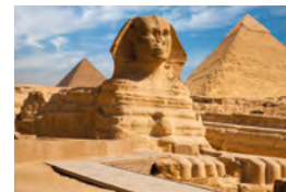
Great Sphinx of Giza Egypt