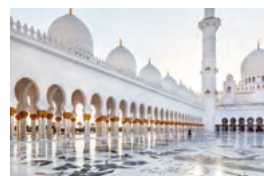
Sheikh Zayed Mosque UAE