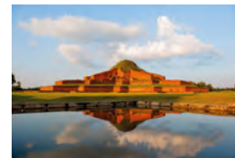
Somapuri Vihara Bangladesh