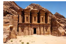
Monastery al-Deir Jordan