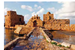
Sidon Sea Castle Lebanon