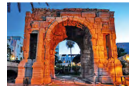
Arch of Marcus Aurelius Libya