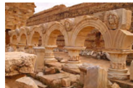
Leptis Magna Libya