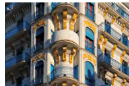
French Colonial Architecture - Algeria