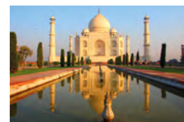
Taj Mahal India