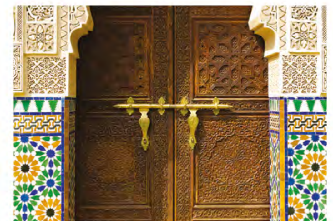
Ornate door, Morocco.