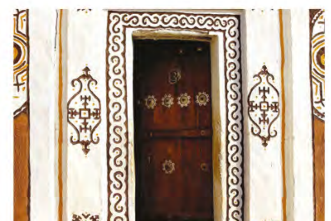
Traditional door, Mauritania.