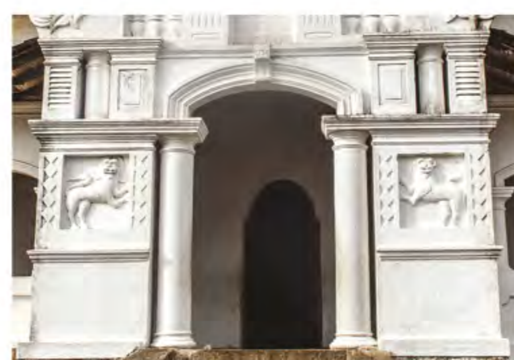
Dambulla Temple, Sri Lanka.