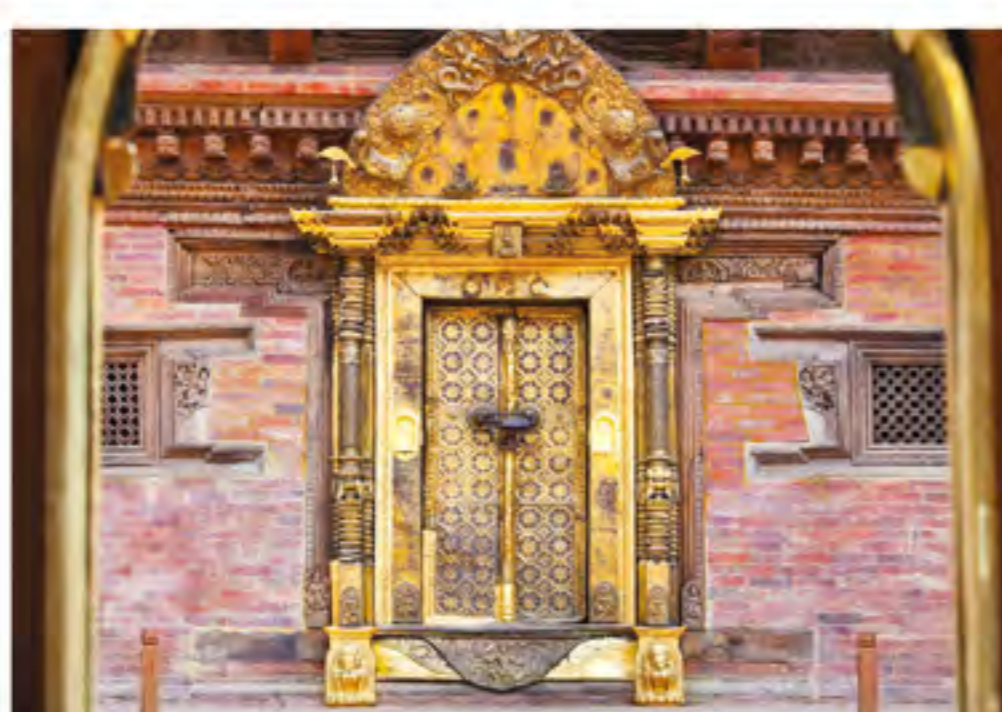
Gold carved door in Patan Durbar Square, Nepal.