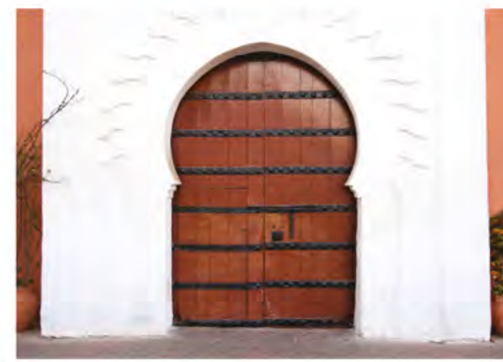
Traditional door, Bahrain.