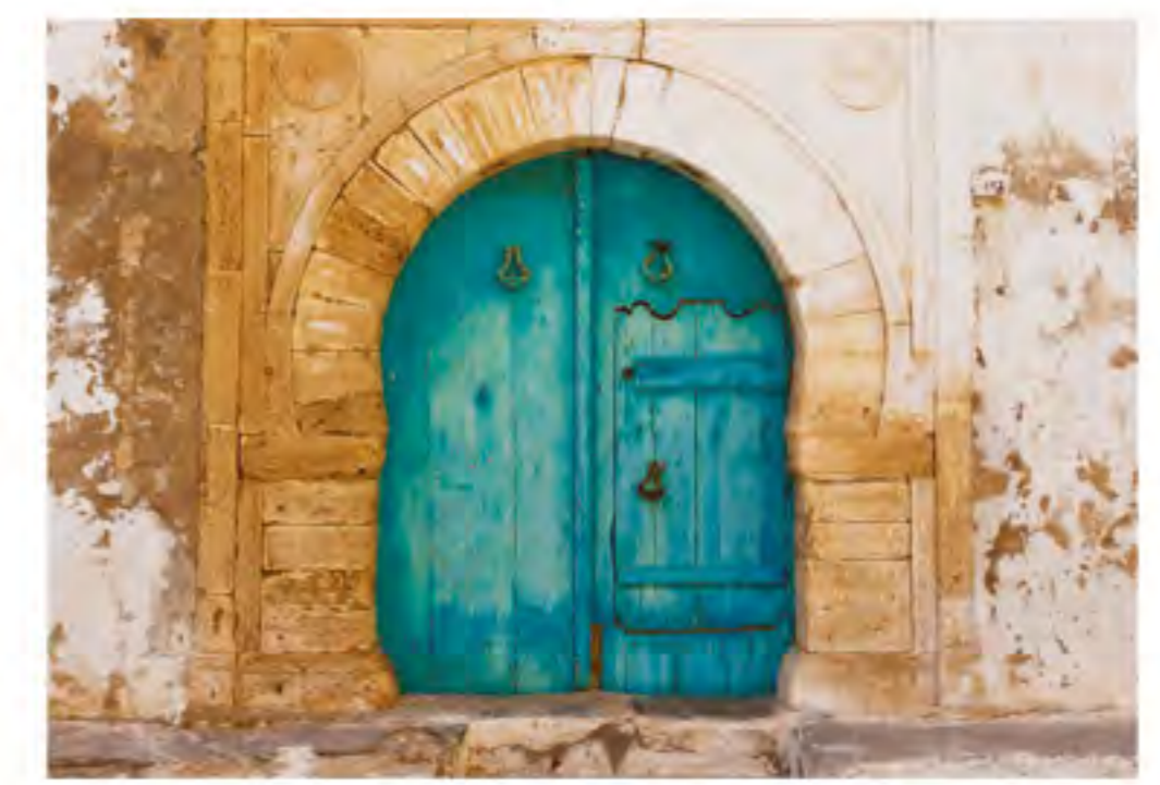
Traditional door, Tunisia.