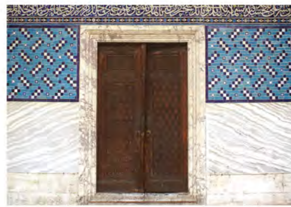
Topkapi Palace, Turkey.