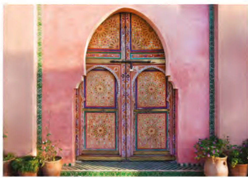
Traditional door, Oman.