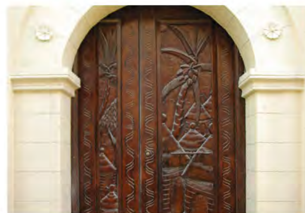
Traditional door, Libya.