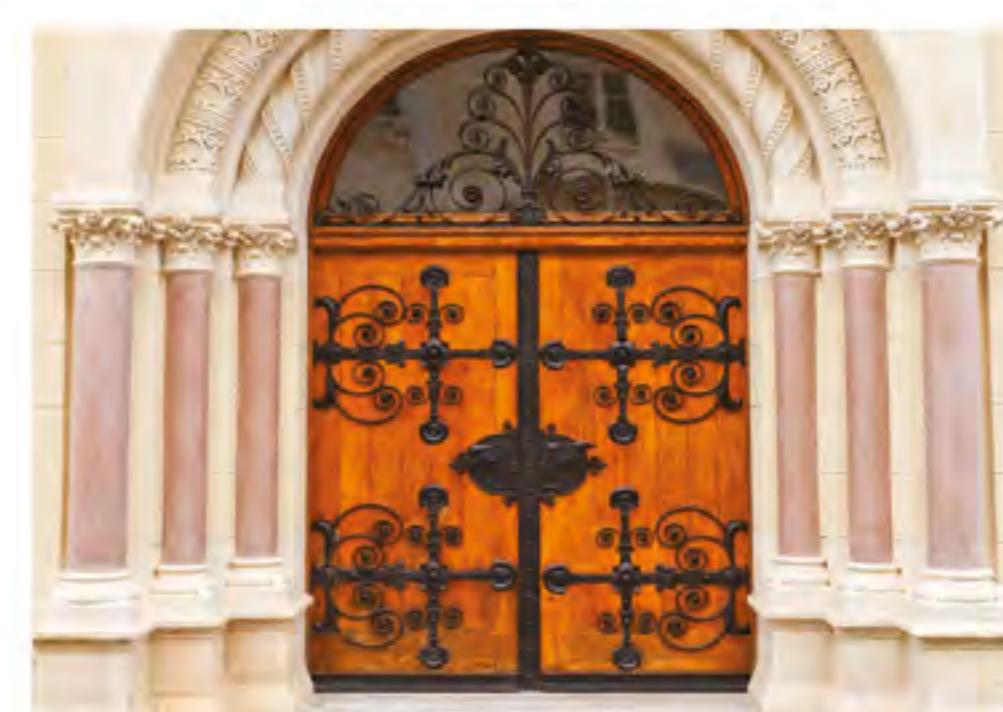
Ornate door, Croatia.