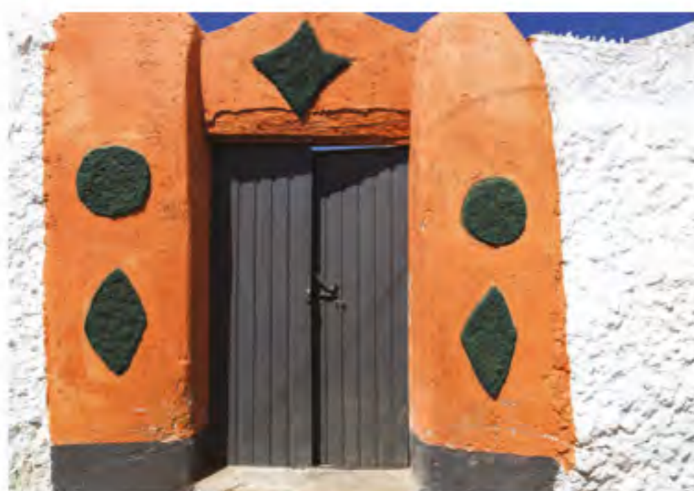
Traditional door, Ethiopia.